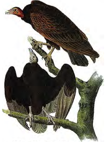
The Turkey Buzzard