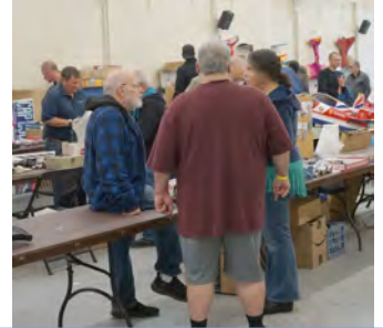
Fall Swap 10/26 & 10/27 Lots of RC Bargains & more