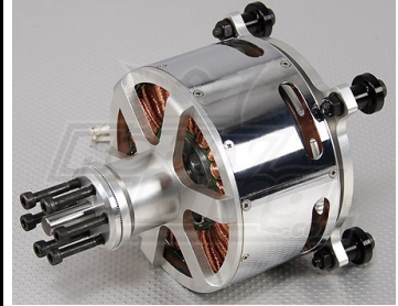
Watts of Power!