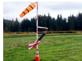
Wind & Rain—No Problem!