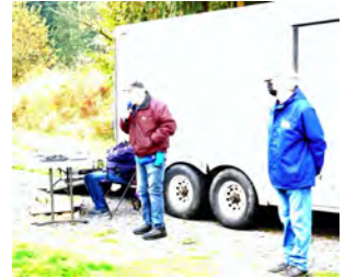
Our Annual Club Auction raised $721.00 this year! We will take the check to the Sky Valley Food Bank.

November's Program: NW Model Hobby Expo Discussion—What did you take home and stories of the ones that got away! The club booth and the swap area.