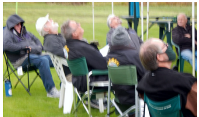
Lookin' up at the club meeting. Could be the last this year due to the Daylight Saving Time and the sun's position.