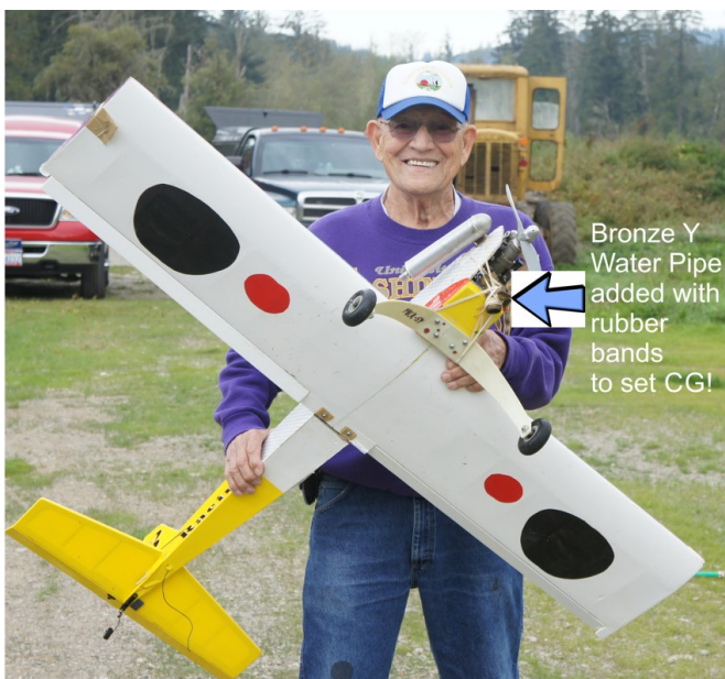
Bronze Y Water Pipe added with rubber bands to set CG!