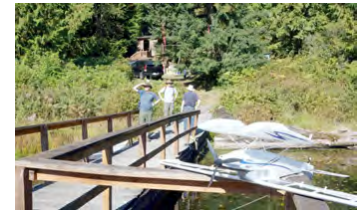
Floats & Boats photos on pages 6&7

October's Program: Rebuilder's Competition! Club Auction & NW Model Hobby Expo. We'll have signup pages for the auction and our booth at the NW Model Hobby Expo. Club members who help get in free!