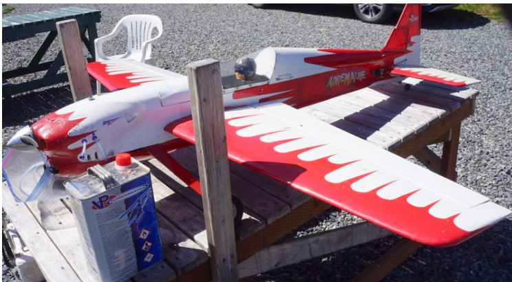
The Adrenaline model flying with a YS 140L engine rescued by Mark. It went down when the wing attachment nut backed off and the wing rotated around the wing tube. Repairable, but it will be a while before this one flies again. Seems like Charlie Higgins had a model that had wings that rotated on purpose.