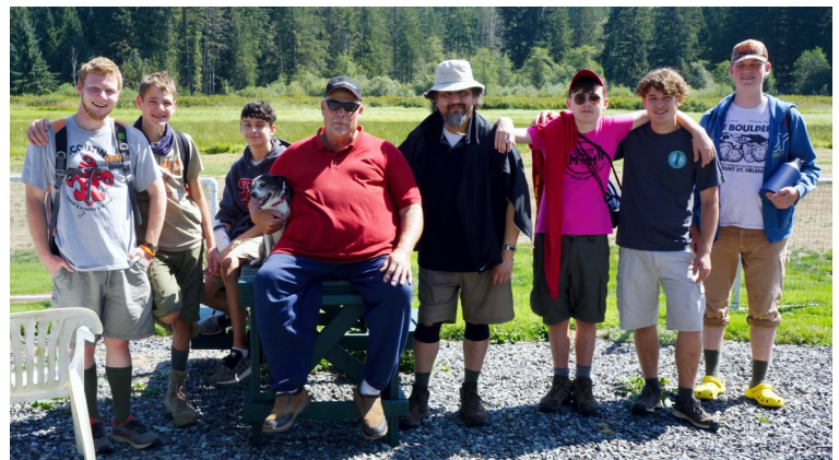
Some of the scouts that visited the field this month. They said they had fun watching us fly.