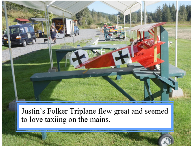
Justin's Folker Triplane flew great and seemed to love taxiing on the mains.