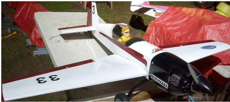
Ron Swift's new plane lost the main gear on landing. Flew great tho... the Super Tigre 90 quit running, forcing the dead stick landing.