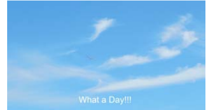
What a Day!!!