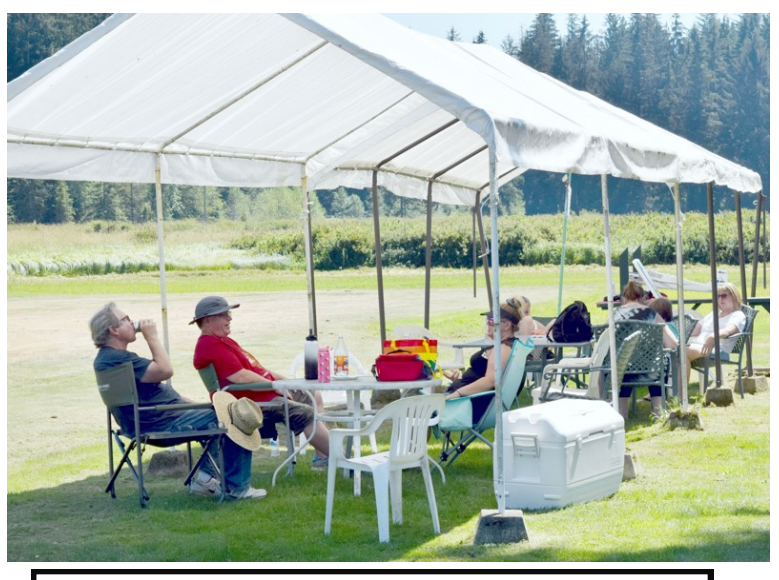
Lunch with roasted attendees

From some reports, there were a few families and club members who came to this event. They shared the grilled hotdogs and hamburgers, but that day was way too hot for most to be outside. Some areas hit triple digits. Earlier weather reports had us believing Saturday was to be a nice day. Not so and the heat extended into Sunday as well. Here are some photos received from the event.