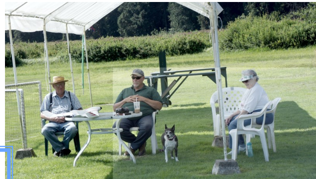
Several Octogenarians and changes in the landscape to the West. Lots of fun going on at our flying field. Many thanks to the Scouts!