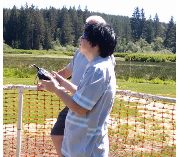
Best advice—buy and use a flight simulator, then find an instructor who will advise what to buy, how to build, and fly.