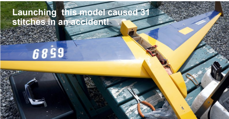
Launching this model caused 31 stitches in an accident!