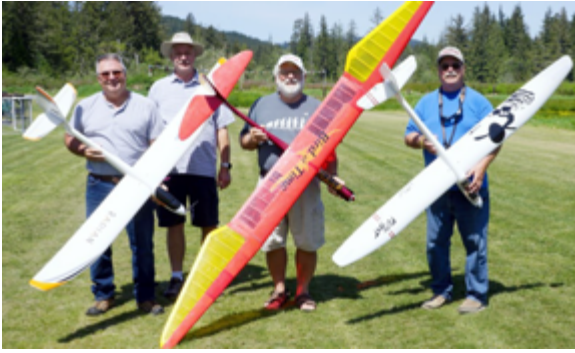
Winners on the left and all pilots on the right.