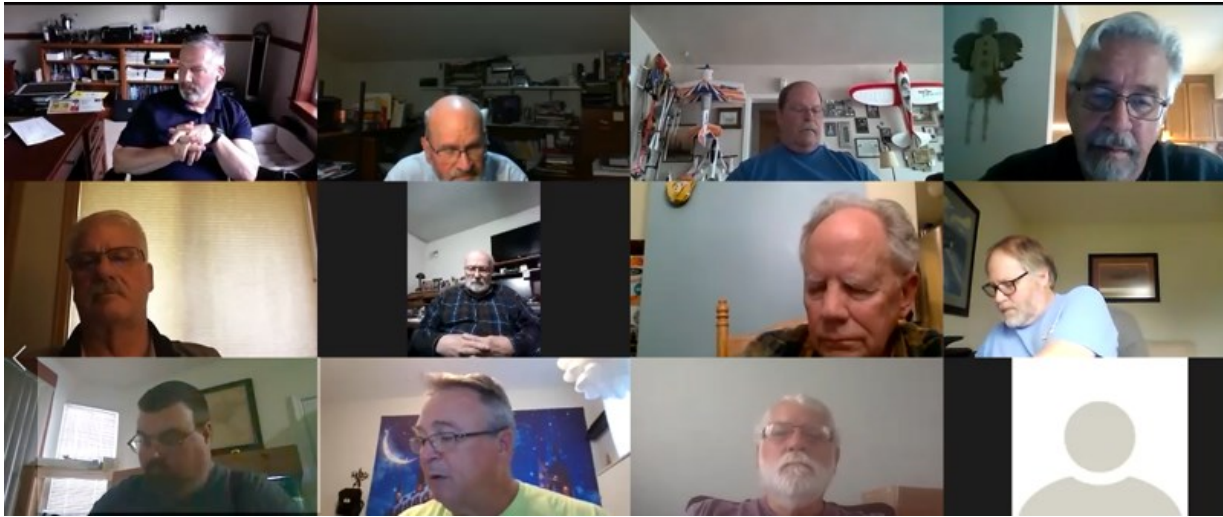
Club meeting attendees..