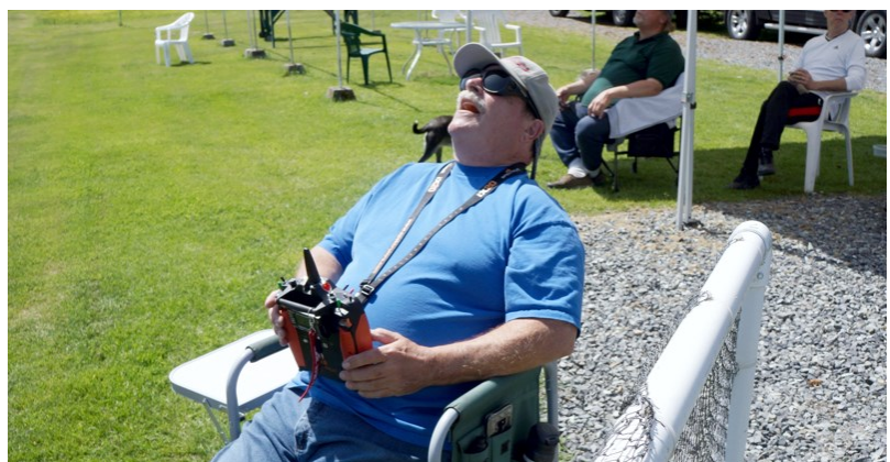
1st place winner - the Dart Technique of glider piloting