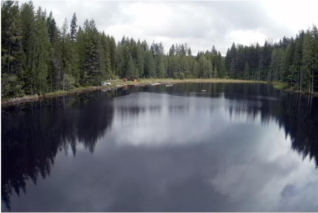
Hughes Lake Looking North from Chet