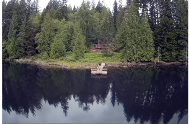
Hughes Lake Looking West from Chet

Yes, amazingly enough, Camp Edward (formerly known as Camp Brinkley) has a Snohomish address! You can use the above address to put into your GPS to get to the camp area. We hope you'll check on our progress as we develop our new grass flying field. We also have a lake from which to fly. You can go to the camp website, too: