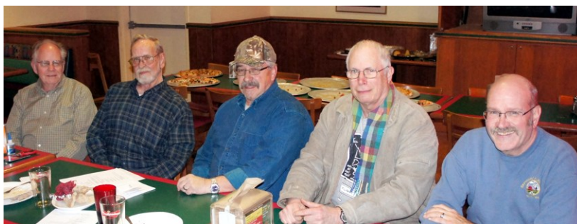
Your 2014 Board of Directors