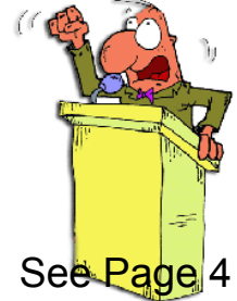
See Page 4

Next Club Meeting is Tuesday, June 14, 2010, 6:30 PM at our club field in Monroe (See page 9 for a map).