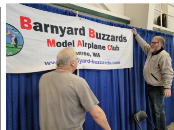
Club booth setup for the Expo! Thank you, guys.

Program: Try #3 FPV Setup and settings. Should be a great instructional for those needing to set up their cameras, transmitters, AS3X, dual rates, expo, and more... Website: http://