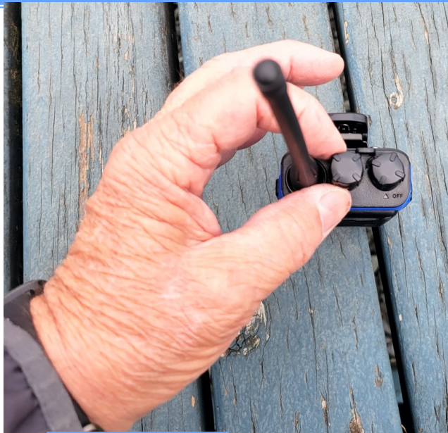
Turn it on