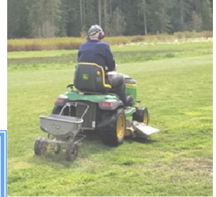
Fun at our club field. Come on out and enjoy the beautiful park like setting.