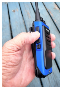
Push to talk - Release to Listen!