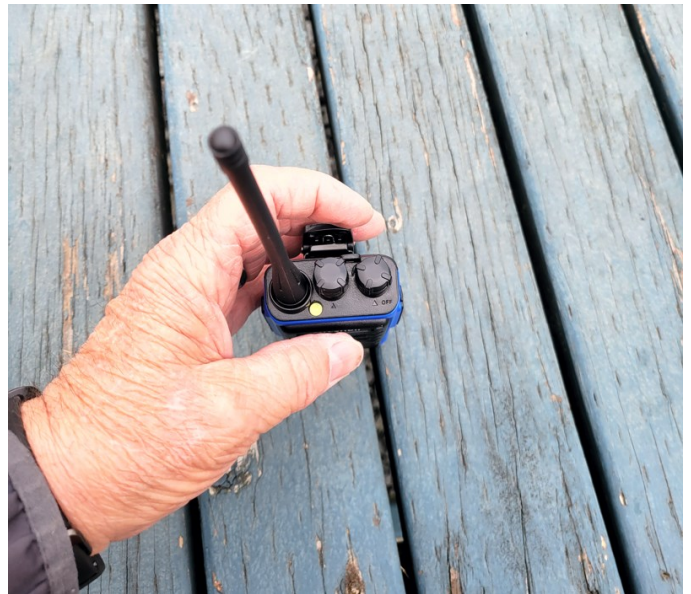
Turn it up