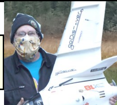
Recommended: Wear a facemask & keep 6 feet from others,

The May 2020 Club Meeting has been cancelled. Stay tuned for future meeting notices. More info on Page 9. Stay safe and enjoy the building season!