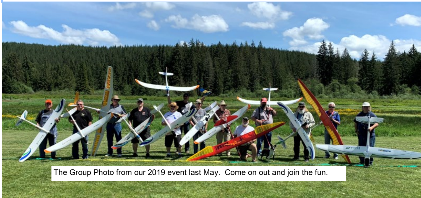
The Group Photo from our 2019 event last May. Come on out and join the fun.

Make sure to give feedback to us for improving the safety and event fun. We will likely use this approach for the other club flying events this year.