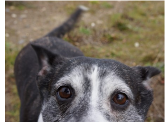
The Greeter is Back!

Program: FPV Mini Quads, and Controllers