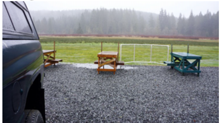
Just in case you didn't notice, our field has been bombarded with rain and snow intermittently over the past two months. Yes, boots, walking stick and helpers required if the models go astray.