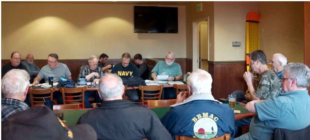
Meeting and Show & Tell - What Fun!