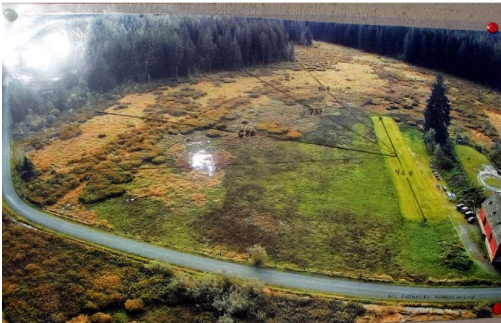
Birds eye view—a photo from Jay posted on our frequency board. Runway 424 feet and growing...