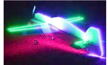
April 30 Night Flight Event Club Field Starts at 5:00

Next Club Meeting is Tuesday, April 12 th , 6:30 PM at Alf's Pizza on RT 2 in Monroe ( See page 9 for a map ).