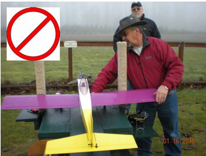
This picture shows how not to pick your airplane off the table.