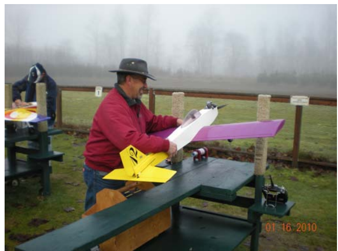
This picture shows a much safer method.