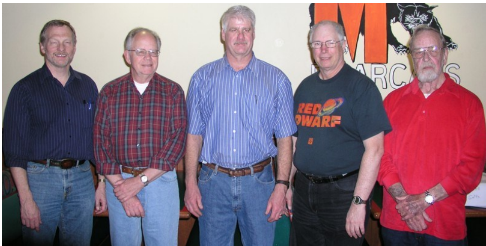
Board of Trustees 2011