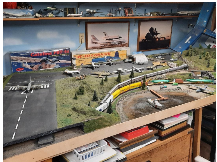
Ryden Air Museum