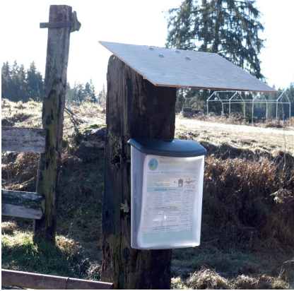
Our new newsletter box.