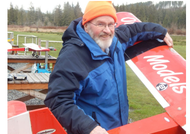
Fun flying in cold weather.

Our March 2021 Club Meeting will be held Wednesday, March 10th, online through Zoom at 6:30 PM. This is in keeping with the guidance from the medical professionals and scientists for gatherings of larger groups. We hope that we get way beyond phase 1 soon and can have our usual club meetings. Program: Safer Plane Retrieval