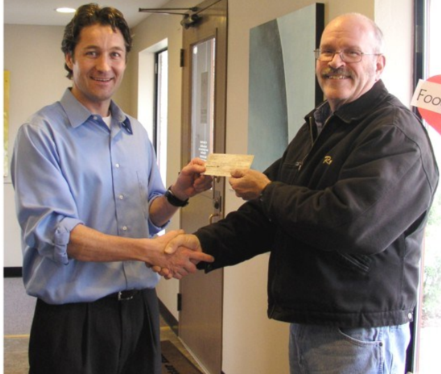
$100.00 Donated From the Expo to the Local Food Bank