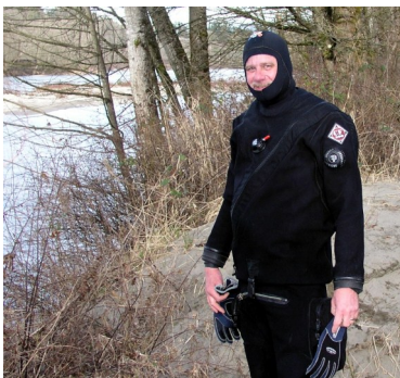
Dressed to dance!