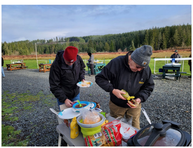
BBMAC Freeze-In 2022