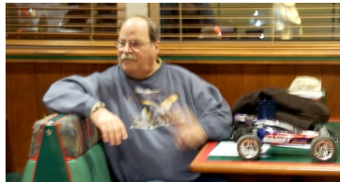
Photos of the Show & Tell and the presentation during our meeting.