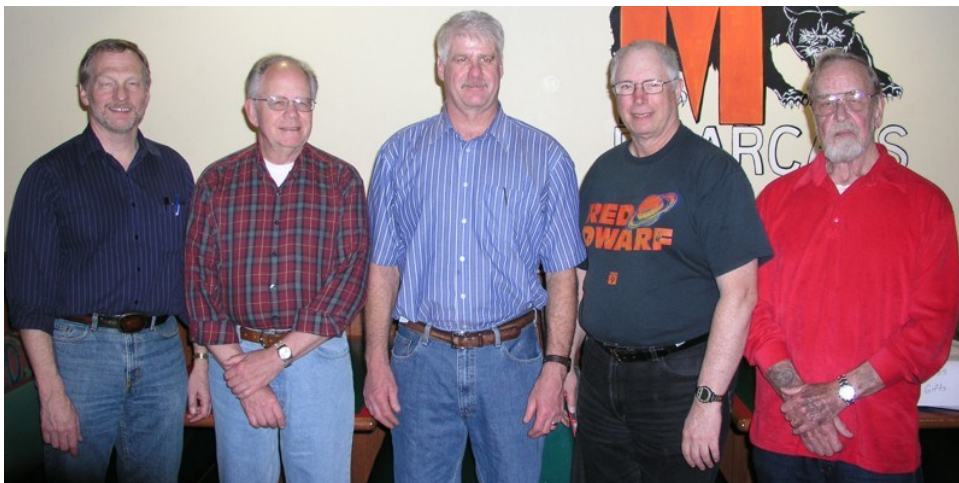
Board of Trustees 2011